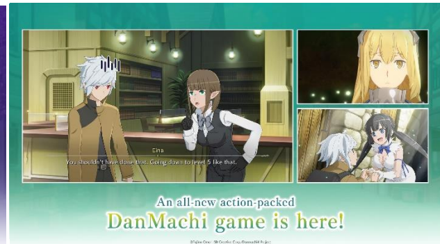
Relive the Anime's Story

***Images are contents under development.