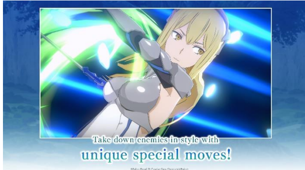
Dynamic Special Moves in 3D

The game is fully loaded with contents such as a battle royale where everyone is your enemy and the autoplay combat, "Battle Arena," where setup will be key. Challenge the dungeon together with your favorite characters like Bell and Hestia!