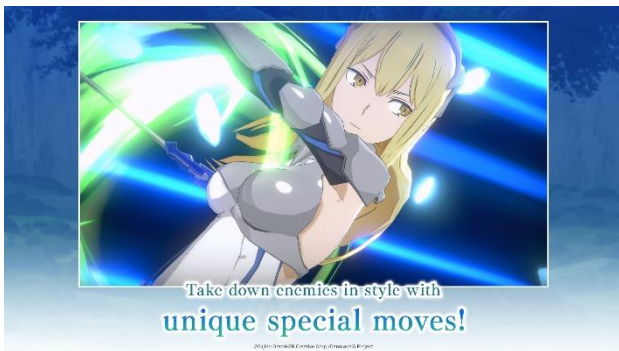
Dynamic Special Moves in 3D

The game is fully loaded with contents such as a battle royale where everyone is your enemy and the autoplay combat, "Battle Arena," where setup will be key. Challenge the dungeon together with your favorite characters like Bell and Hestia!