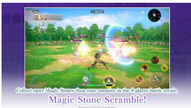
Fight multiple players in the Battle Royal