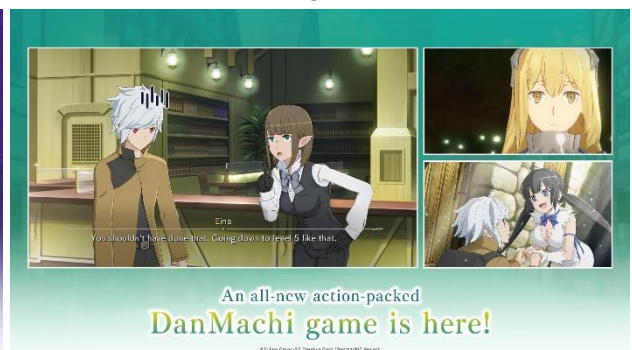
Relive the Anime's Story