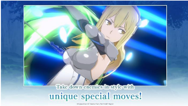
Dynamic Special Moves in 3D