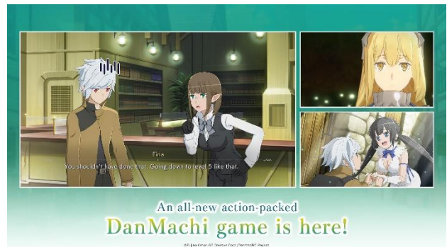
Relive the Anime's Story

Game Introduction Promo Video #1: https://youtu.be/BbZu_u_gaeQ