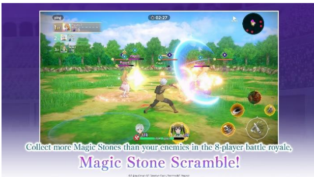
Fight multiple players in the Battle Royal