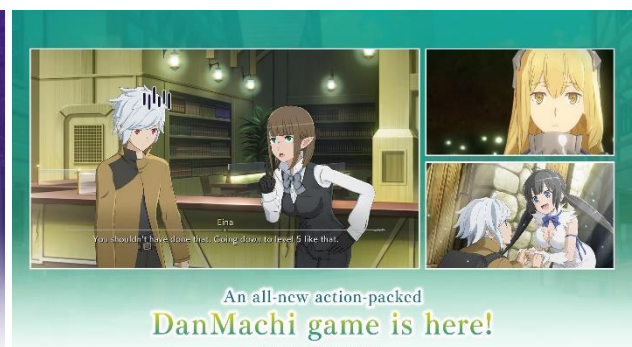
Relive the Anime's Story

Game Introduction Promo Video #1: https://youtu.be/BbZu_u_gaeQ