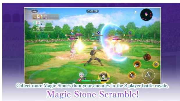
Fight multiple players in the Battle Royal