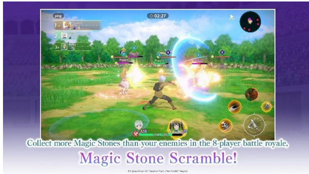
Fight multiple players in the Battle Royal