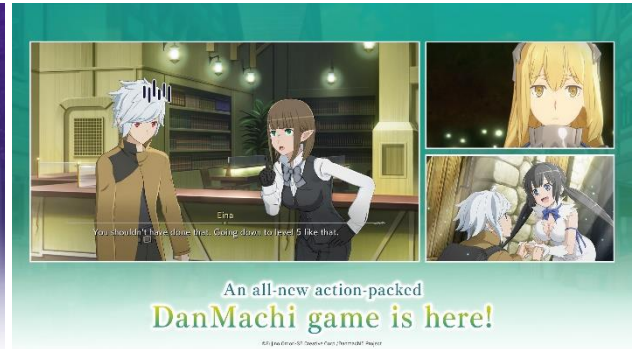
Relive the Anime's Story

Game Introduction Promo Video #1: https://youtu.be/BbZu_u_gaeQ