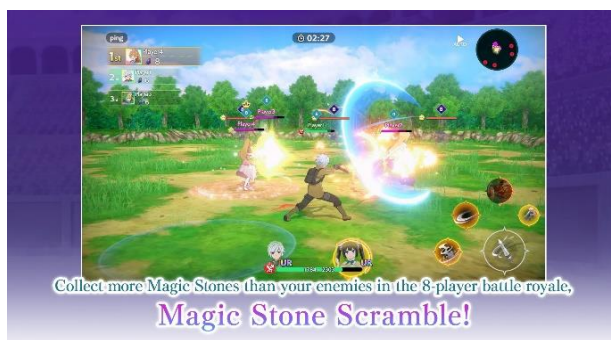
Fight Many Players in a Battle Royale