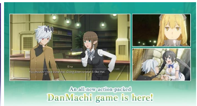
Relive the Anime's Story