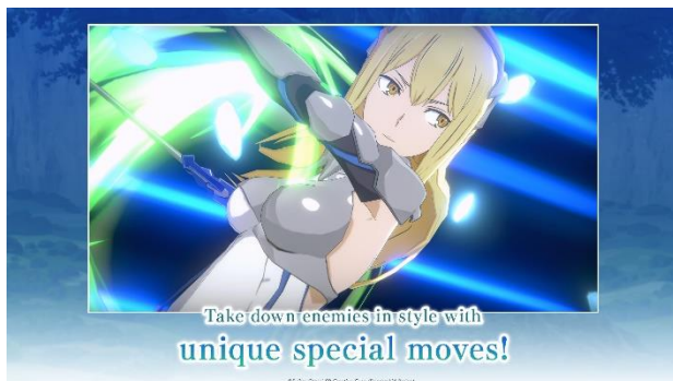
Dynamic Special Moves in 3D

The game is fully loaded with contents such as a battle royale where everyone is your enemy and the autoplay combat, "Battle Arena," where setup will be key. Challenge the dungeon together with your favorite characters like Bell and Hestia!