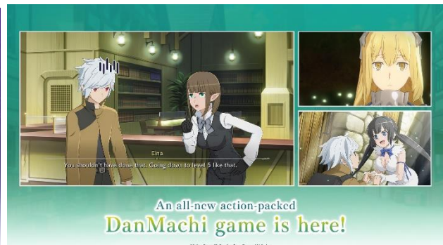
Relive the Anime's Story