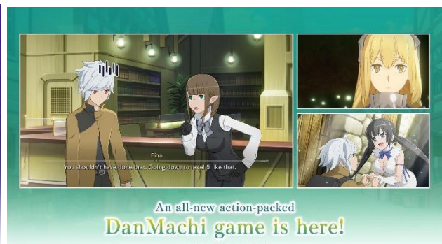
Relive the Anime's Story