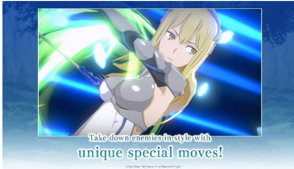
Dynamic Special Moves in 3D