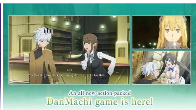
Relive the Anime's Story

*The images above are from the game in development.