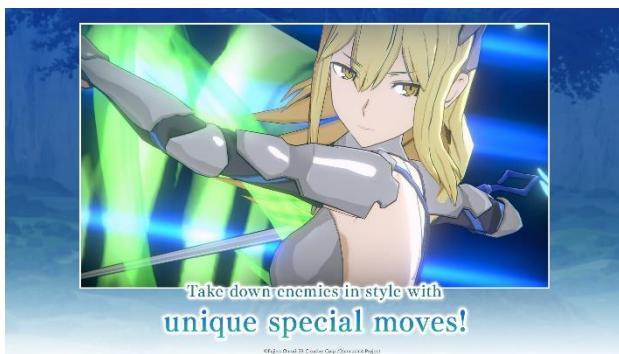
Dynamic Special Moves in 3D