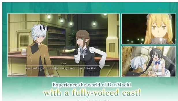
Relive the Anime's Story

*Contents of the photos above are under development.